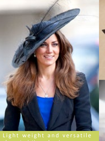
Light weight and versatil characteristic make sinamay eas to shape for trimmings.